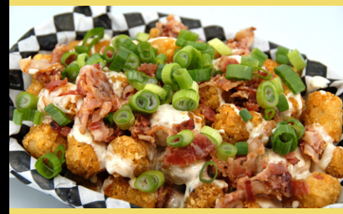
LOADED TATER TOTS