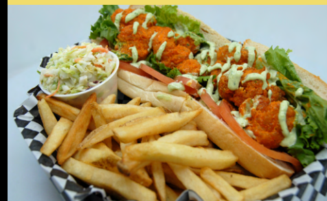
BUFFALO SHRIMP PO BOY