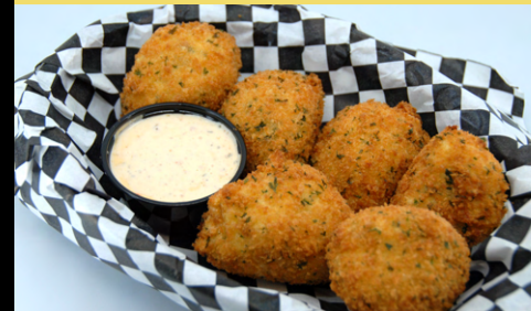
MAC AND CHEESE BALLS