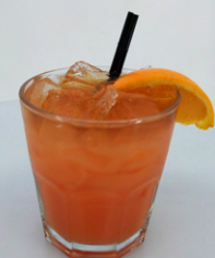
BANANA RUM PUNCH

STOLI VODKA, MANGO PUREE, AND HOMEMADE SWEET ICED TEA