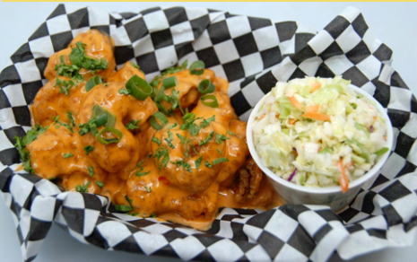
SPICY GLAZED SHRIMP

6 CRISPY POTATO SKINS, GENEROUSLY TOPPED WITH CHEDDAR/JACK CHEESE, 4 OZ BACON BITS, AND SCALLIONS. SERVED WITH A SIDE OF SOUR CREAM. ADD ONS: 4 OZ GROUND BEEF 4.49 | 4 OZ BBQ PULLED PORK 4.49