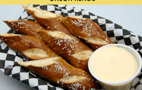
PRETZEL AND QUESO

LIGHTLY BATTERED FRIED ONION RINGS. SERVED WITH A TANGY AIOLI SAUCE