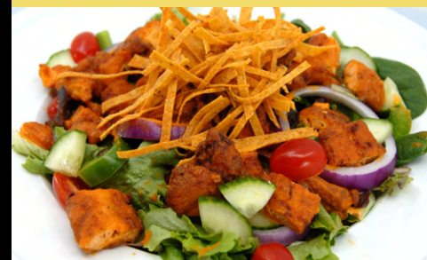
BUFFALO CHICKEN SALAD

5 HOMEMADE FRIED CHICKEN TENDERS TOSSED IN BUFFALO SAUCE, TOMATOES, CUCUMBERS, GREEN PEPPERS, TORTILLA STRIPS AND RED ONION RINGS ON BED OF FRESH, CRISP GREENS