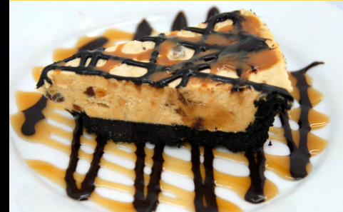
REESE'S PEANUT BUTTER PIE