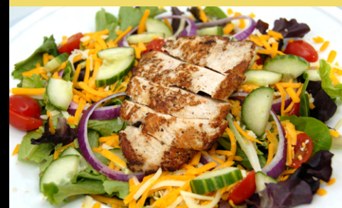
HOUSE SALAD WITH CHICKEN

ADD ONS: 6 OZ GRILLED, BLACKENED OR FRIED CHICKEN BREAST 5.99 | 2 SLICES APPLEWOOD SMOKED BACON 2.99 | 2 OZ HAM, CHICKEN OR SALAMI 3.49 | 6 FRIED SHRIMP 7.99 | SLICED 1/2 AVOCADO 2.49 | 4 OZ CHEDDAR/JACK CHEESE 3.49 | REAL PARMESAN CHEESE 1.99 | EXTRA DRESSING 1.29