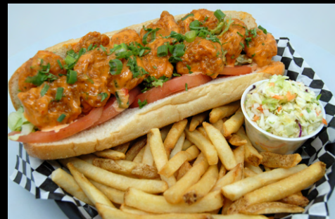
SPICY GLAZED SHRIMP PO BOY

HANDHELDS SERVED WITH HOUSE FRIES | ADD COLESLAW 2.99 | ADD SIDE SALAD 5.49 | SUBSTITUTE FOR CURLY, CRINKLE, TOTS, OR SIDE SALAD 2.99 | LOAD IT UP +4.95