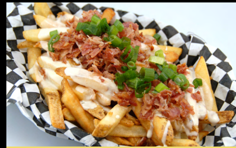
LOADED HOUSE FRIES

ADD ONS: 6 OZ GRILLED/FRIED/BLACKENED CHICKEN 5.99 | 4 OZ GROUND BEEF 4.49 | 6 OZ BEEF SLICED THIN 7.49 | 4 OZ BBQ PULLED PORK 4.49 | 6 FRIED SHRIMP 7.99 | SOUR CREAM 1.49 | DRIZZLED LIME SOUR CREAM 1.49