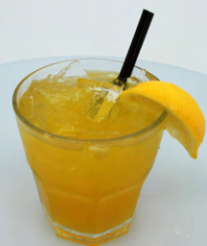
MANGO ICED TEA

BACARDI SUPERIOR RUM, AMARETTO, ORANGE AND PINEAPPLE JUICE, GINGER ALE, GRENADINE