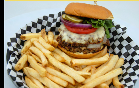
PORK BURGER (DOUBLE)