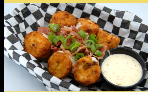
LOADED SUPERSIZED STUFFED TATER TOTS