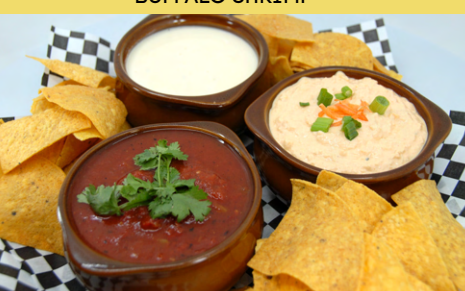
CHIPS & DIPS

12 BREADED FRIED SHRIMP TOSSED IN BUFFALO SAUCE AND DRIZZLED WITH CILANTRO SCALLION LIME GARLIC MAYO, THEN PLACED ON A BED OF SHREDDED LETTUCE. SERVED WITH A SIDE OF COLESLAW