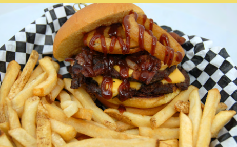
COWBOY BURGER (DOUBLE)