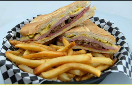
NEW TAMPA CUBAN (WHOLE)