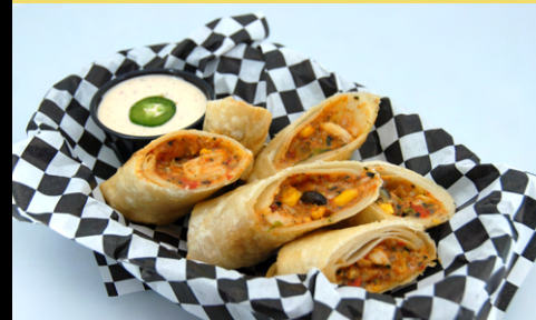
SANTA FE EGG ROLLS