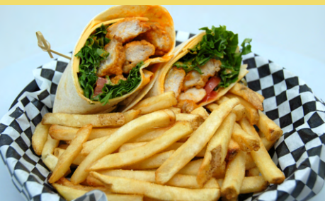
BUFFALO CHICKEN WRAP