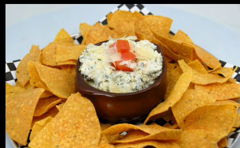
SPINACH & ARTICHOKE DIP

ASIAN STYLE UMAMI SEASONED GROUND PORK, WATER CHESTNUTS, BAMBOO SHOOTS, CARROTS CABBAGE AND SCALLIONS. SERVED WITH SWEET CHILI DIPPING SAUCE... CRUNCHY AND TASTY!