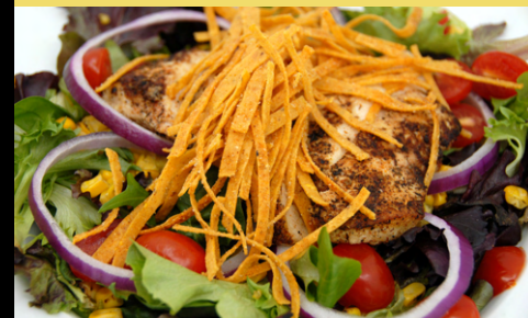
BLACKENED CHICKEN SALAD

BLACKENED CHICKEN BREAST (6 OZ), TOMATOES, CORN, TORTILLA STRIPS AND RED ONION RINGS ON BED OF FRESH, CRISP GREENS