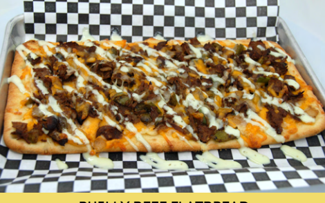
PHILLY BEEF FLATBREAD

OVEN-BAKED FLATBREAD TOPPED WITH GRILLED CHICKEN BREAST (6 OZ), CHEDDAR/JACK CHEESE, RED ONIONS AND HOMEMADE DAYTONA SAUCE