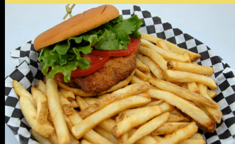
FRIED CHICKEN SANDWICH