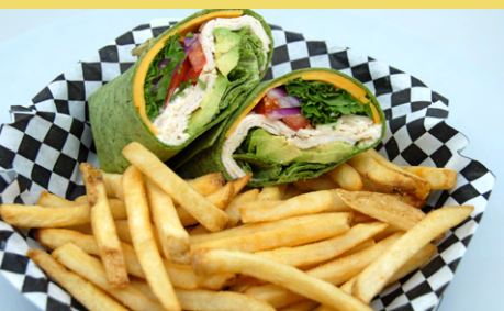
WEST COAST CHICKEN WRAP