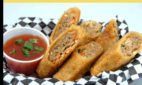
ASIAN STYLE EGG ROLLS