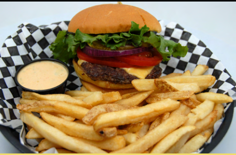
BWBB BURGER (SINGLE)

OUR HOMEMADE 100% ANGUS BEEF BURGERS ARE SMASHED, SEASONED AND BROWNED TO PERFECTION FOR INCREDIBLE FLAVOR, TEXTURE AND TENDERNESS. ALL BURGERS COME WITH A HALF ORDER OF OUR CRUNCHY, REAL, SKIN ON HOUSE FRIES