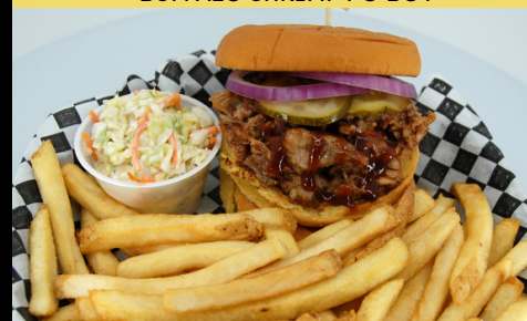
BBQ PULLED PORK SANDWICH