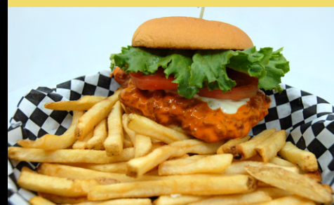
BUFFALO CHICKEN SANDWICH