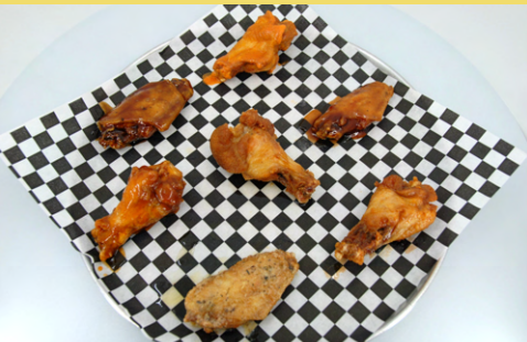
WING SAUCE COLORS BY POSITION

PEABODY'S IS RENOWNED FOR OUR DELICIOUS WINGS & TENDERS... FRIED TO PERFECTION! GET YOUR CHOICE DOUSED IN A MOUTH-WATERING SAUCE OR A REAL BUTTER & DRY RUB FOR LIGHT, FLAVOR BURSTING GOODNESS