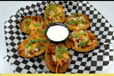
LOADED POTATO SKINS