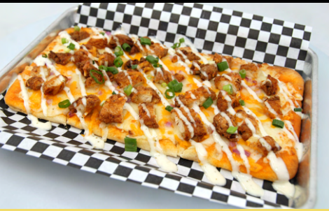
BUFFALO CHICKEN FLATBREAD