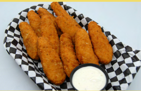
MEATLESS BONELESS WINGS