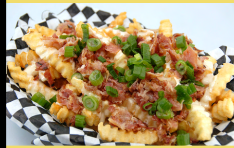
LOADED CRINKLE FRIES