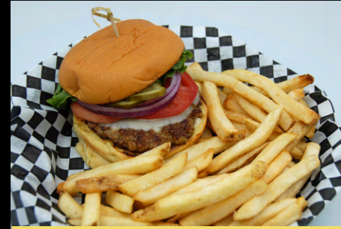
PORK BURGER (SINGLE)

PORK BURGERS SERVED WITH HOUSE FRIES | ADD HOUSE SALAD 5.49 | ADD COLESLAW 2.99 | SUBSTITUTE FRIES FOR CURLY, CRINKLE, TOTS OR SIDE SALAD 2.99 | LOAD IT UP +4.95