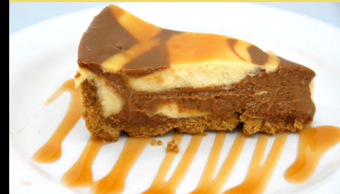
SEA SALT CARAMEL CHEESECAKE