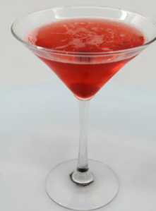
RASPBERRY POMEGRANATE MARTINI

JAMESON IRISH WHISKEY, PEACH SCHNAPPS, SWEET AND SOUR MIX