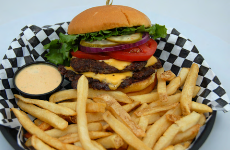
BWBB BURGER (DOUBLE)