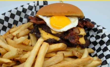
BREAKFAST BURGER (DOUBLE)