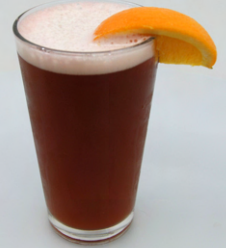
BLUE MOON RASPBERRY

DEEP EDDY GRAPEFRUIT VODKA, LIME JUICE AND GINGER BEER